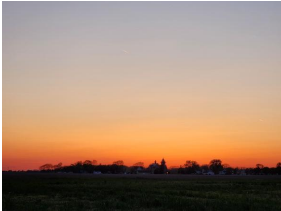
2025-06-20 A Venedocia town sunset.

Salem Presbyterian Church P.O. Box 678 15240 Main Street Venedocia, Ohio 45894