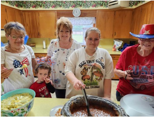
2025-05-28 Shown is the Senior Luncheon and Bingo final meeting before the summer break. The luncheon will resume on September 24th. All are invited for a fun time. Shown here are the cooks and helpers.