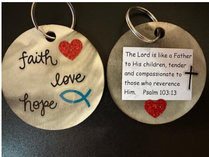
2025-06-15: Father's Day gift made by the youth in recognition of Godly Fatherhood and next column, the children handing out gifts to the fathers.