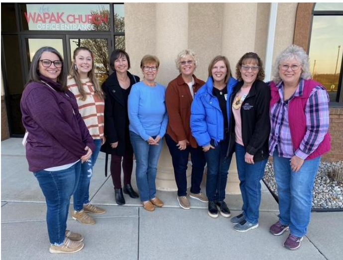
2025-04-16 Salem Women's Group at the women's Last Supper Experience at the Wapakoneta Church.