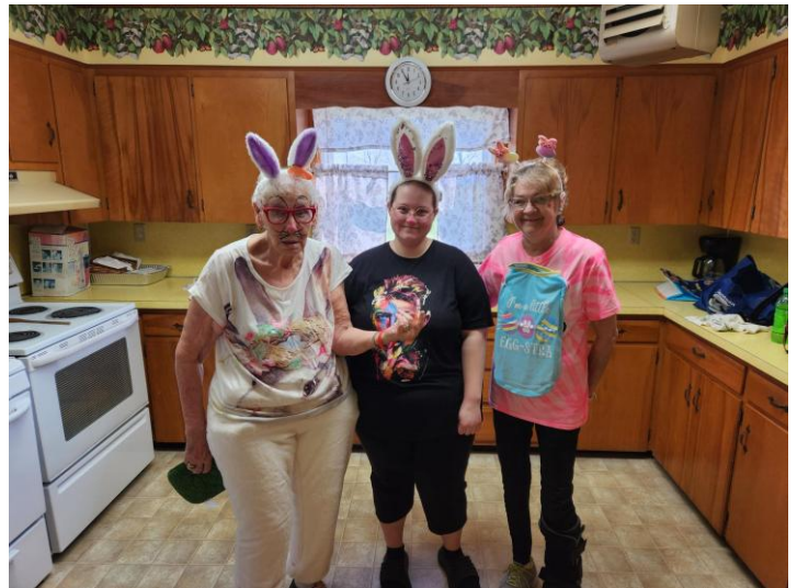
2025-04-23 Senior Luncheon and Bingo servers