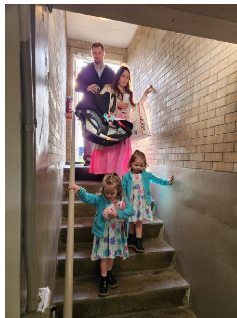
2025-04-20 Easter Sunday Sunrise breakfast