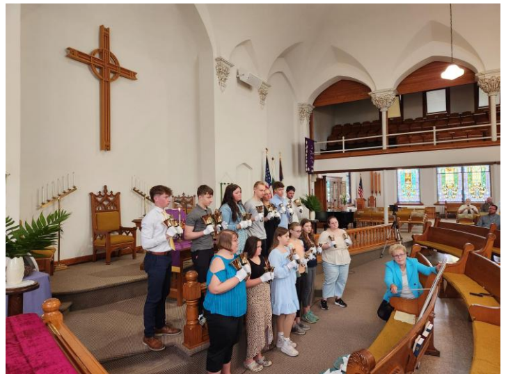
2025-04-13 Palm Sunday Bells