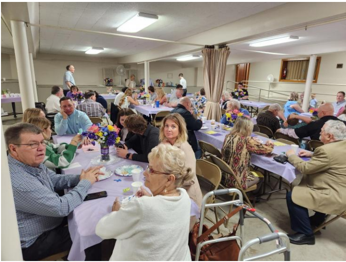
2025-04-20 Easter Sunday Sunrise Breakfast