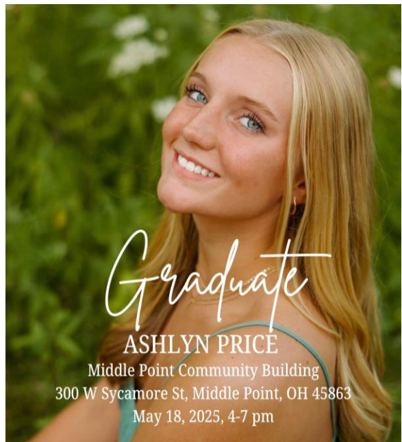
Graduation Party Invitation