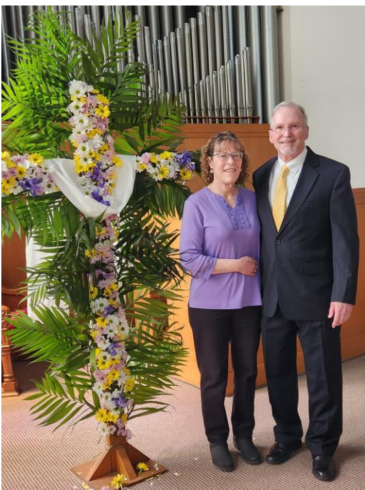
2025-04-20 Easter Sunday after the "Flowering of the Cross Ceremony"