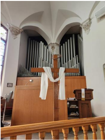
2025-04-20 Easter Sunday Undecorated Cross

Salem Presbyterian Church P.O. Box 678 15240 Main Street Venedocia, Ohio 45894