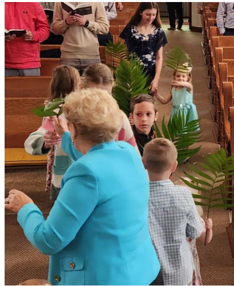
2025-04-13 Palm Sunday children carrying the Palm branches

The Session and the Trustees met to envision the future of Salem Church. We are participating in the National Day of Prayer at the Courthouse steps. During the month of May, the Van Wert County Prayer Association will be hosted at Salem Church on Thursdays at noon in the Salem Prayer room before rotating to another area church (everyone is invited). Our finances are steady considering the upcoming unpredictable economic climate.