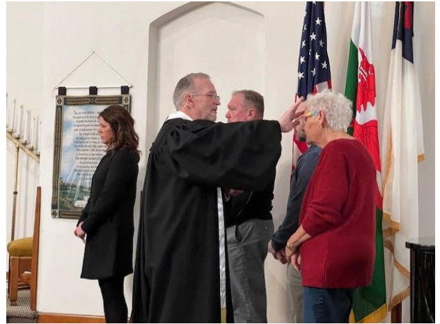
2025-01-19 Session anointed with oil during the Installation of Officers.