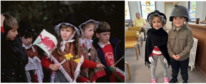
Welsh National Celebrations in Wales and at Salem in Welsh costumes.