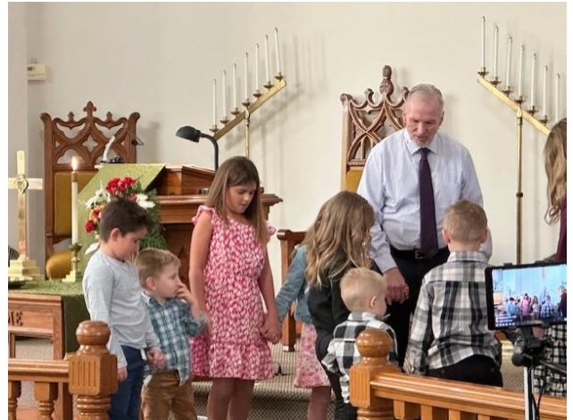
2025-01-26 Time for Children Prayer Time.