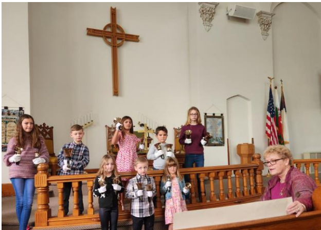
2025-01-19 Junior Bells practice for St. David's Day.