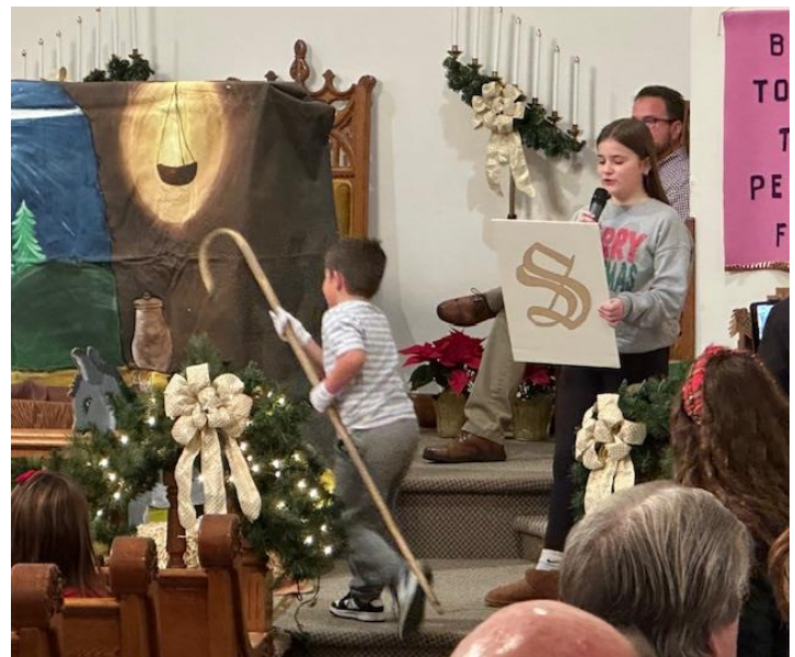
2024-12-15 Youth Service Program.