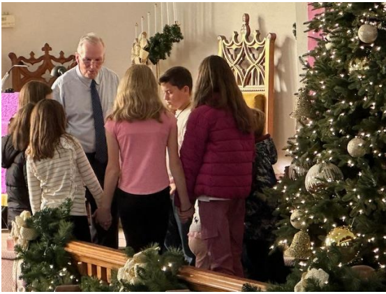
2024-12-08 Time for Children prayer.