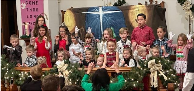
2024-12-08 "Twinkle, Twinkle Little Star" sung by toddlers and youth.