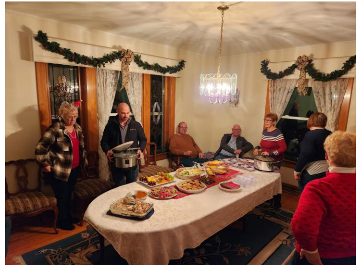
2024-12-15 Manse Party getting started by dropping off food.