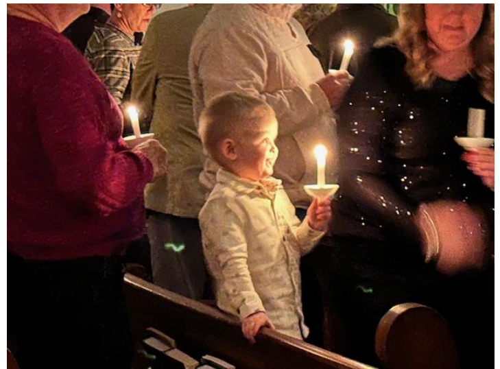
"Silent Night" was sung by the Congregation in candlelight.