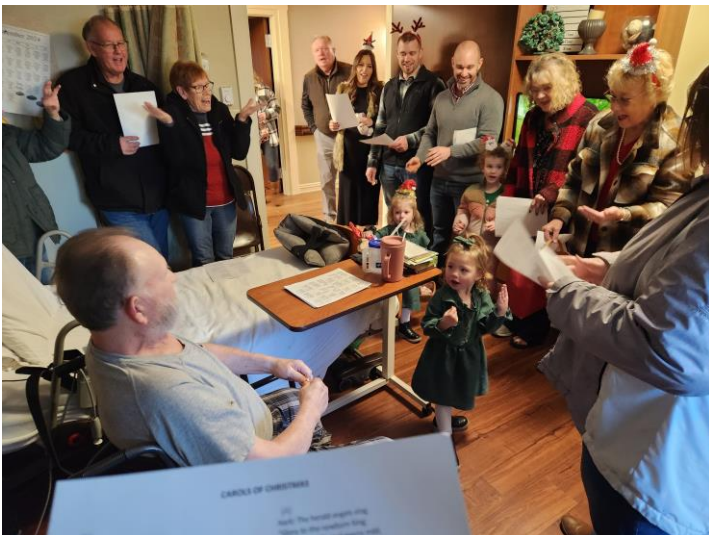
2024-12-15 One of the visits during Christmas Caroling.