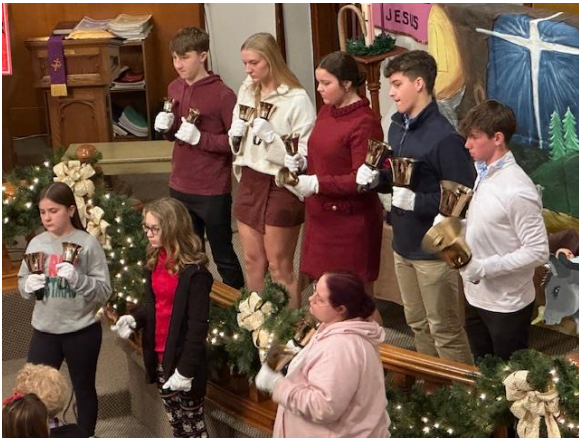
2024-12-08 Older Children's Bell Choir.