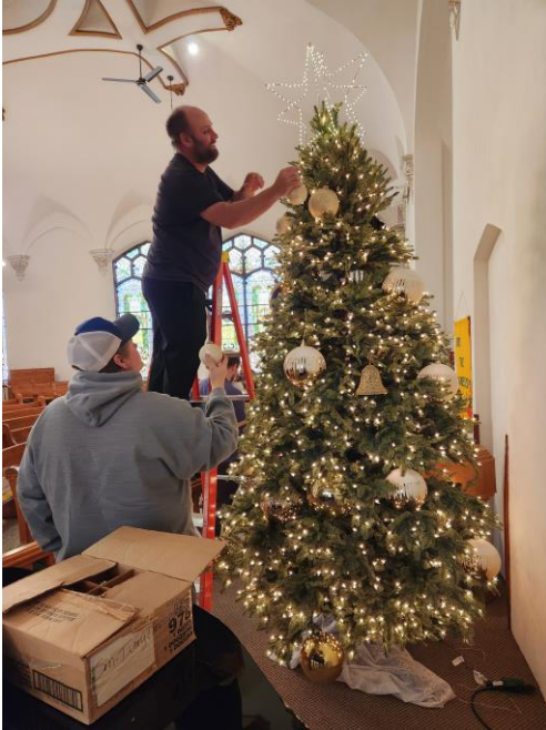
2024-11-24 Christmas decorations.

Salem Presbyterian Church P.O. Box 678 15240 Main Street Venedocia, Ohio 45894