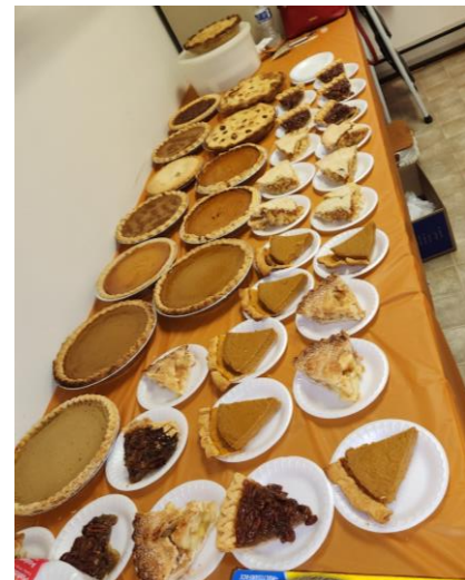
2024-10-05 Salem Church Election Day Supper