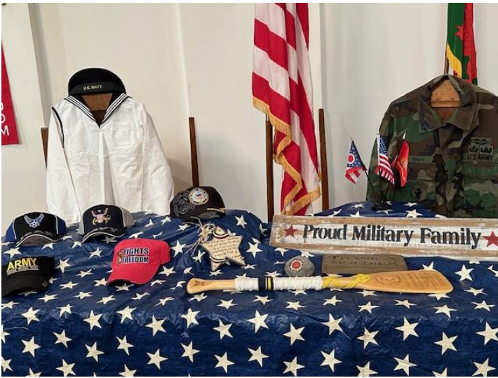
2024-11-10 Veterans Day ceremony exhibit.