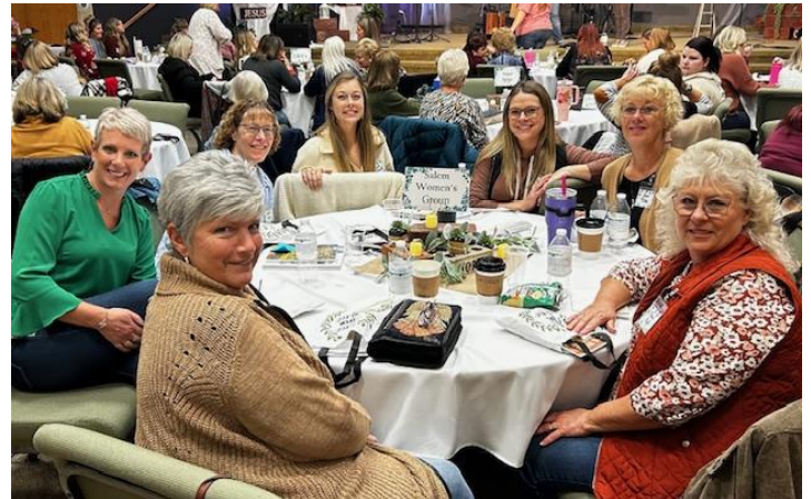
2024-11-02 Women's Conference at Mt. Tabor Church in Celina.