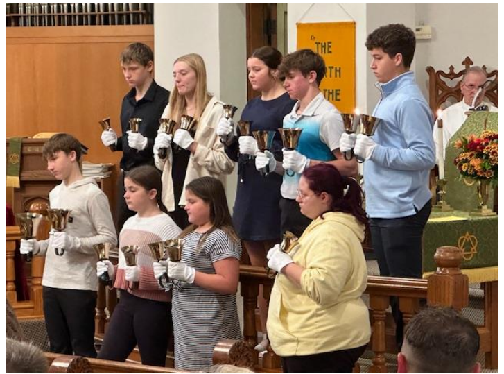
2024-11-24 Younger and older Bells