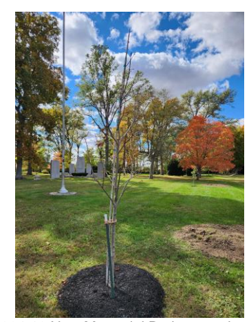
2024-10 New Memorial Park trees planted with the Vacation Bible School fundraising