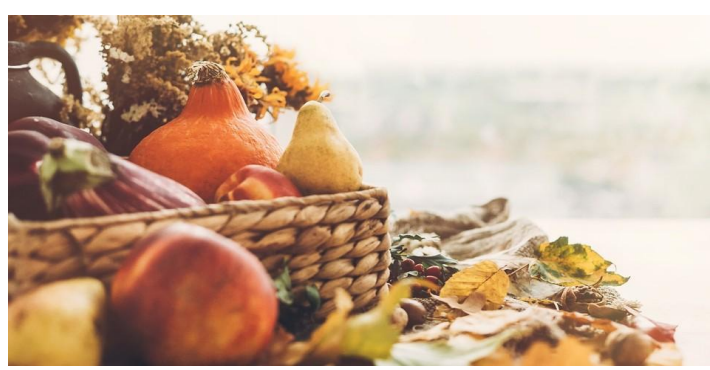
because they can be with their family and talk about how blessed they have been in the present year.

This holiday, which occurred nearly 400 years ago, is one of the holidays that people look forward to the most