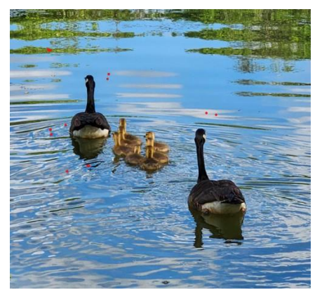
Local Salem pond duckling family

Salem Presbyterian Church P.O. Box 678 15240 Main Street Venedocia. Ohio 45894