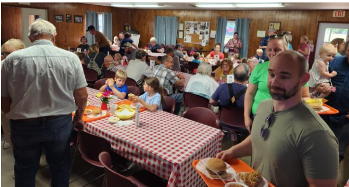
2024-06-21 Ice Cream Social.