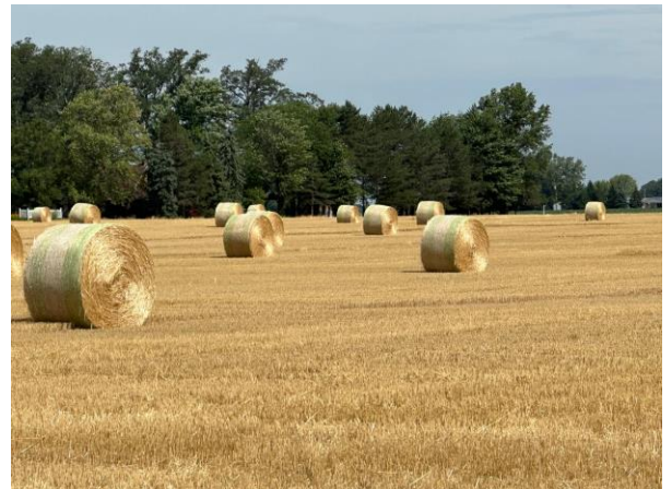
2024-06-28 Wheat harvest finished