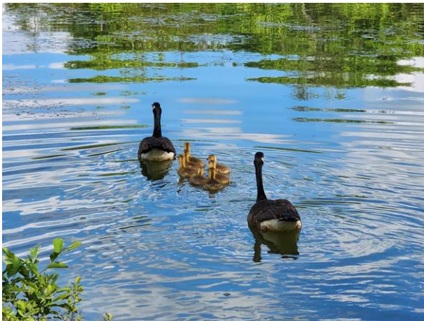
2024-05-28 Kendrick Woods Park Geese