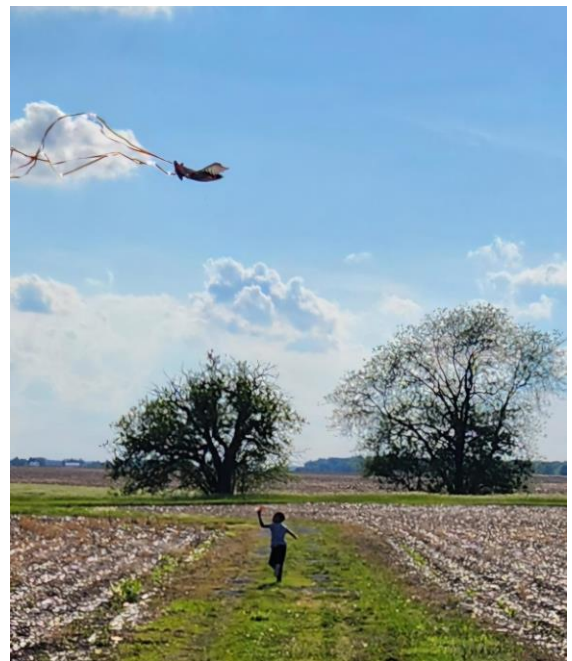
2024-05-28 Kite flying behind the church