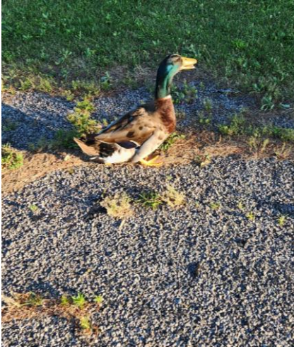
2024-06-09 Duncan, the parking lot friendly tame duck, looking for treats

Salem Presbyterian Church P.O. Box 678 15240 Main Street Venedocia, Ohio 45894