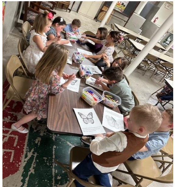
Easter Sunday, Sunday School kids