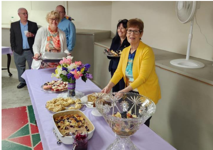
Easter Breakfast preparations