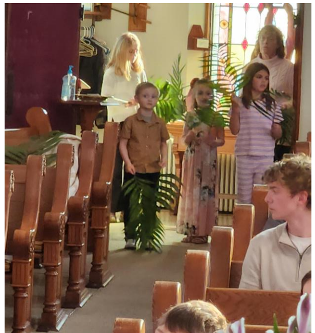
Palm Sunday Ceremony with the Children