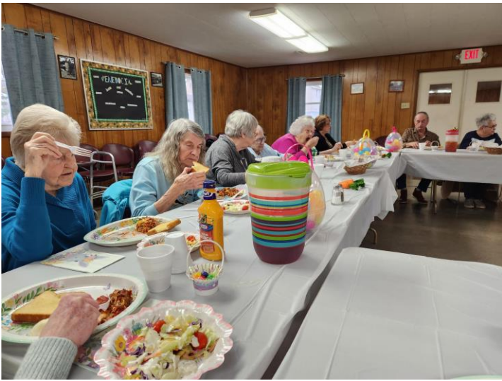
2024-03-27 Venedocia Senior Luncheon and Bingo at the Lions Club