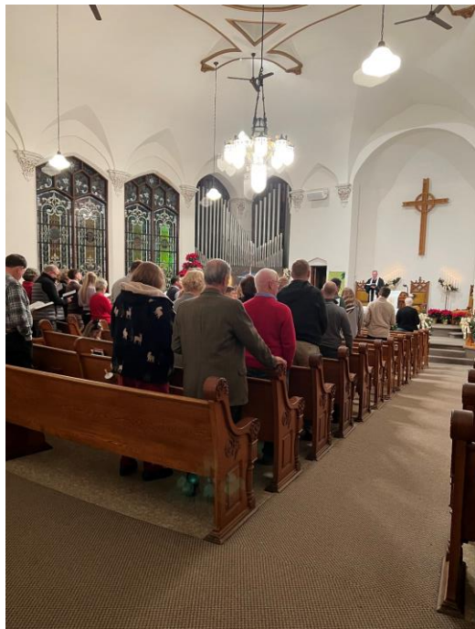
2024-01-28 Sunday service.

Salem Presbyterian Church P.O. Box 678 15240 Main Street Venedocia, Ohio 45894