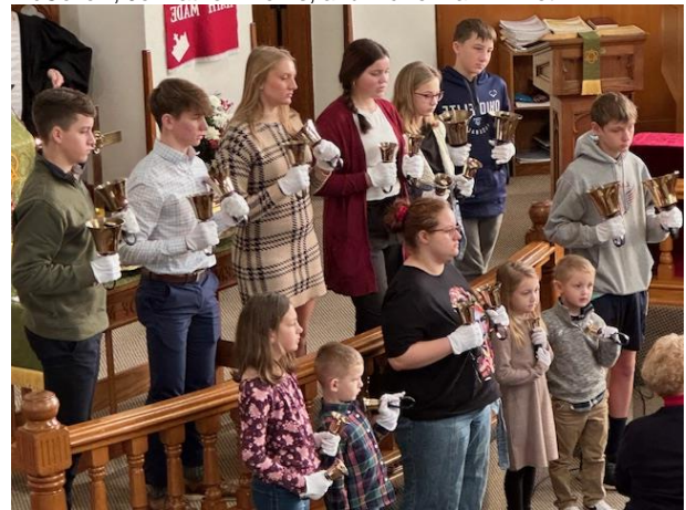
2024-01-14 Junior Bell Choir