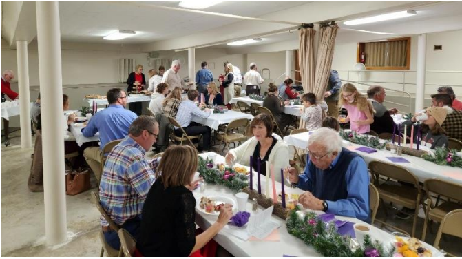
2023-12-03 Advent Breakfast at Salem.