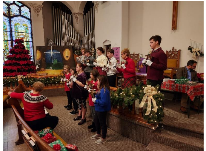
2023-12-17 Youth Christmas Handbells.