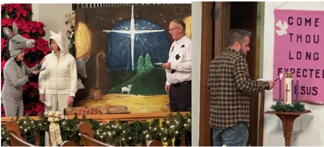
Ongoing December Advent skit and Advent candle lighting.