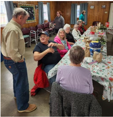
12-23-12-06 Senior Luncheon held at the Lions Club Building.