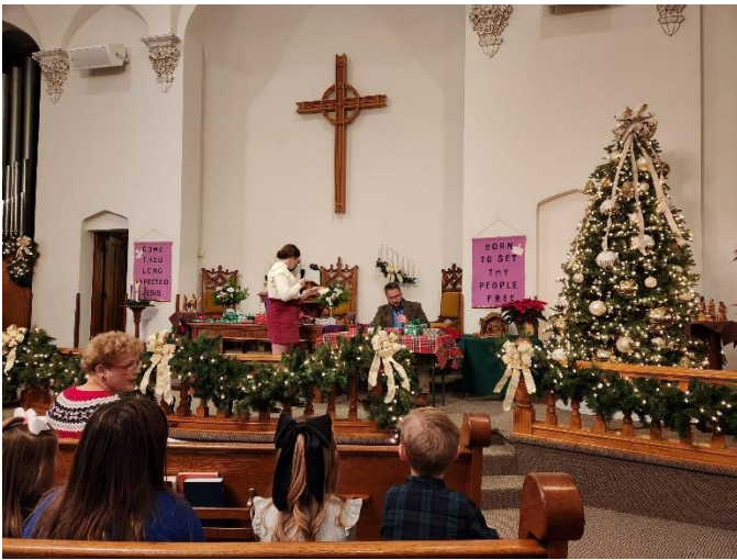
2023-12-17 Christmas Youth Service Play.