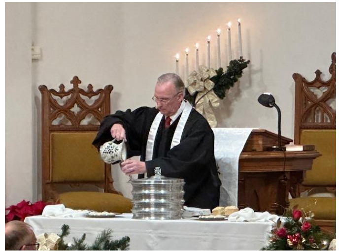
2023-12-24 PM Christmas Eve Service Communion.