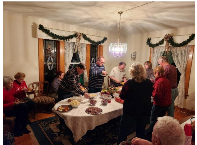
2023-12-10 Manse party and food.