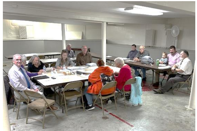
2023-11-12 Session and Trustee Yearly Meeting.