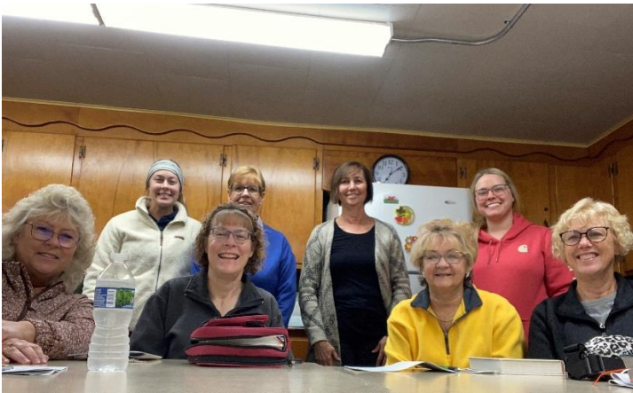
2023-10-31 Salem Women's Bible Study.