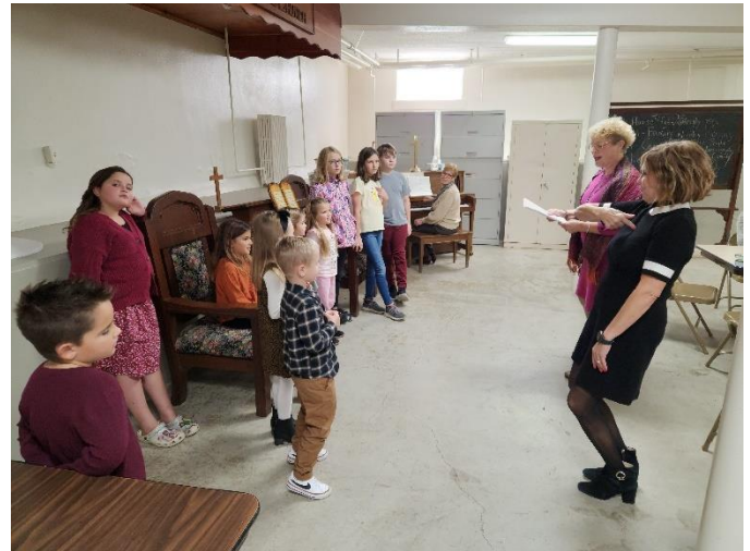
2023-11-19 Children's song practice for the Christmas program.