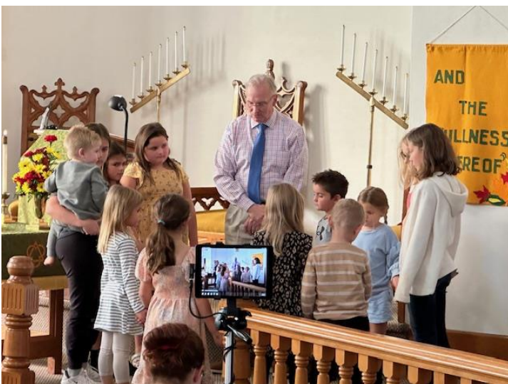
2023-11-12 Time for Children talk and prayer time.