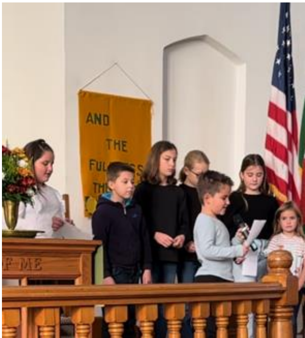
2023-11-12 Veteran's Day children reading a poem beside the veteran's display.