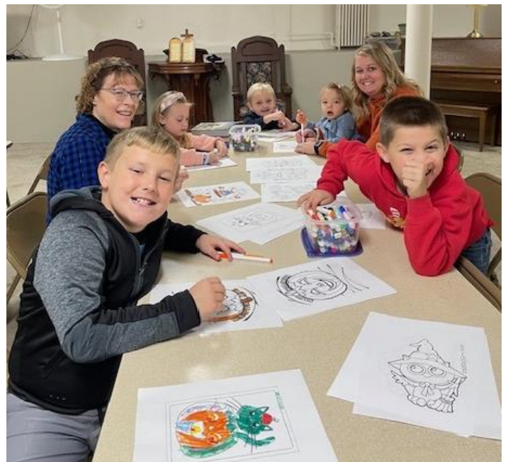
2023-10-29 Younger Sunday School kids