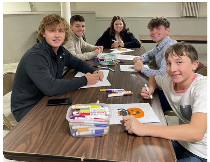
2023-10-29 Older Sunday School kids