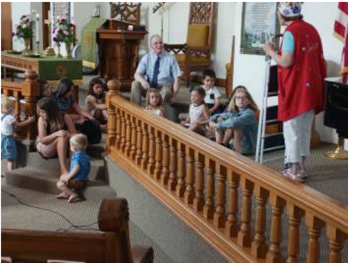
Shown is the Time for Children segment of the service with the Sandy Skit of the sermon points for childhood understanding.