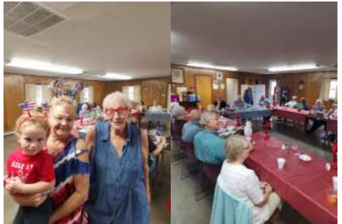
2023-09-27 Senior Luncheon and Bingo at the Lions Club