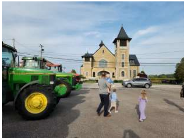
Drive Your Tractor to Church Sunday

Salem Presbyterian Church P.O. Box 678 15240 Main Street Venedocia, Ohio 45894