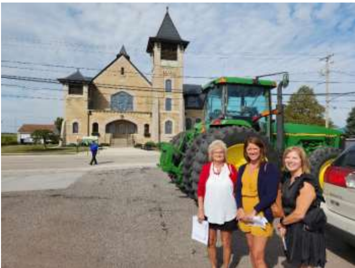
2023-10-17 The Drive Your Tractor to Church Sunday during the Blessing of the Harvest event and potluck.