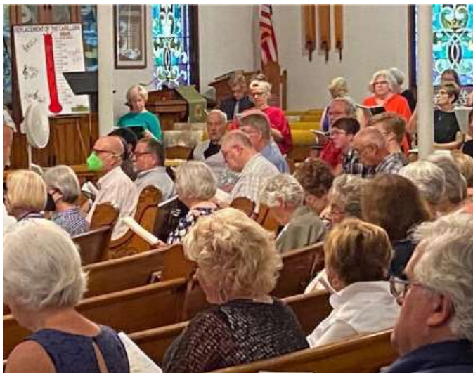
The 2022 Salem Gymanfa

The Venedocia Salem Presbyterian Church will be celebrating a longtime community event with its 106th Gymanfa Ganu on Sunday, September 3rd.