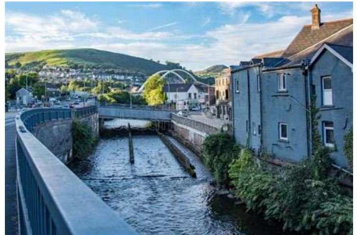
Rhondda village, Wales