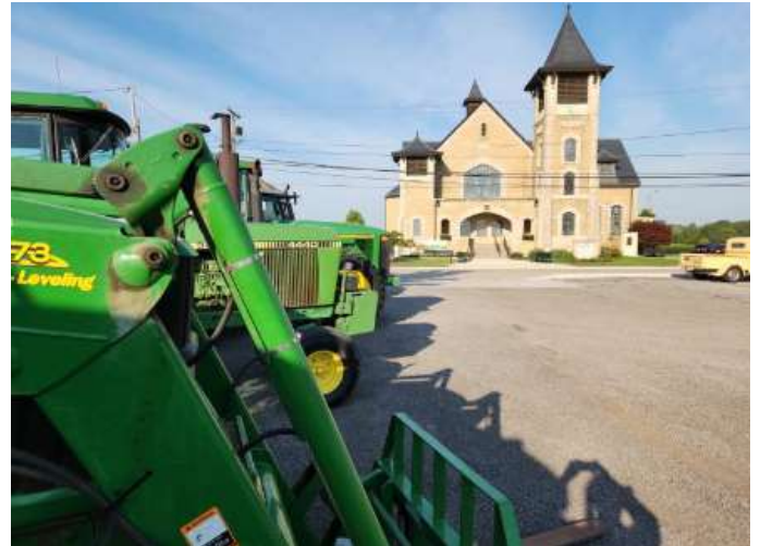
2022-09-18 Drive Your Tractor to Church Sunday and The Blessing of the Harvest. The next event is 2023-09-17.