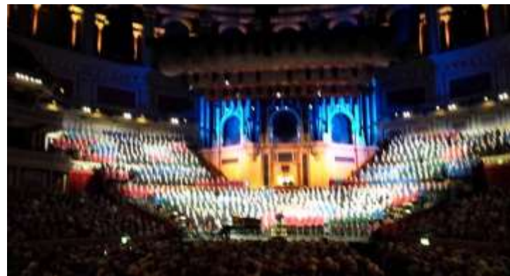
Gymanfa Welsh Voices at the Royal Albert Hall

In Europe, some large annual events occur in chapels and take place at festivals such as the National Eisteddfod and the Llangollen International Musical Eisteddfod. Outside of Wales, in the UK there are Cymanfaoedd Canu in London, parts of the West Midlands and other areas where there are still evangelical chapels using the medium of Welsh 1 . The preservation of the Gymanfa Ganu, as a unique feature of Welsh culture, is being supported by a number of Welsh cultural associations.