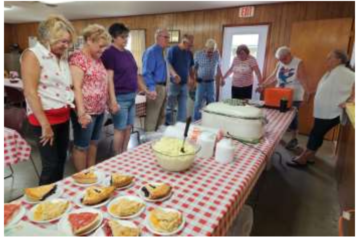
2023-06-16 Prayer before the Salem Ice Cream Social