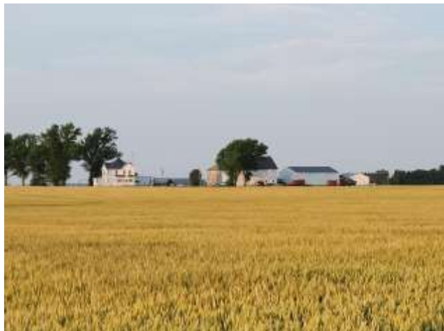
2023-06-24 Owens family farm wheat outside Venedocia.

Salem Presbyterian Church P.O. Box 678 15240 Main Street Venedocia, Ohio 45894