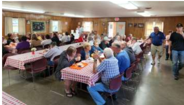
Salem Ice Cream Social filling up.

...choose today whom you will serve. But as for me and my family, we will serve the LORD (Joshua 24:15 NLT).