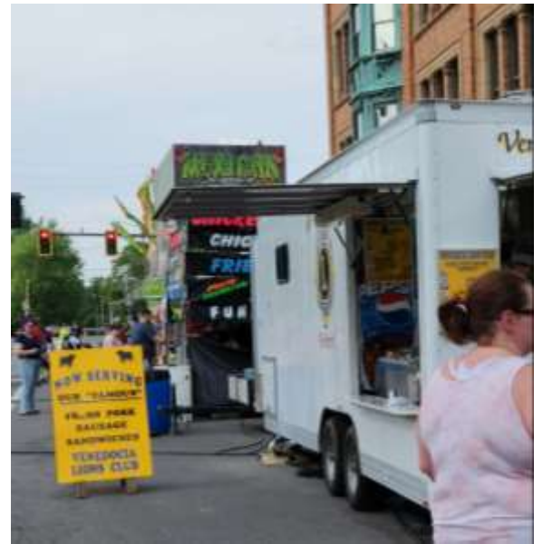
2023-06-03 Peonies Festival Venedocia Lions Club Sausage Sandwiches booth