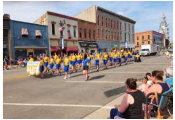
2023-06-03 Peonies Festival Parade at Van Wert