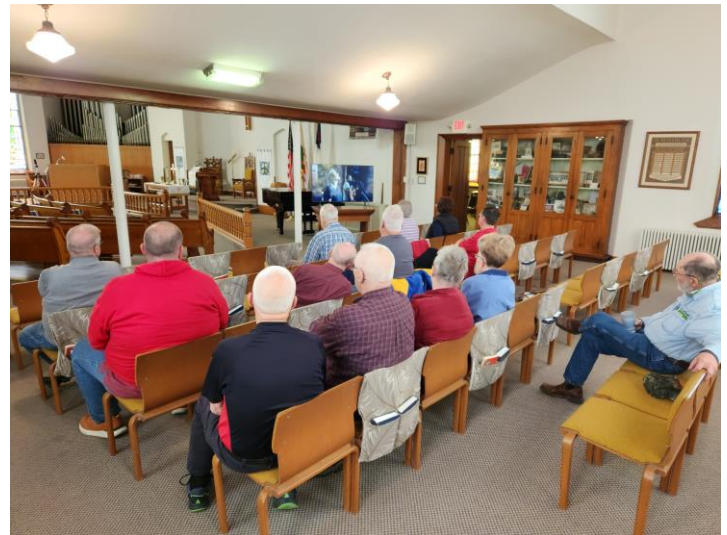
2023-05-18 Van Wert County prayer warriors meeting for the month of May each Thursday at noon at Salem's Prayer Room.