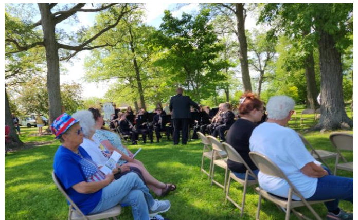
The Lincolnview Marching Band played at the Memorial ceremony.