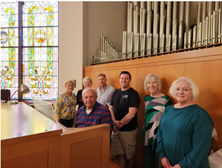
2023-05-13 Visiting organists instructed on playing the carillon.