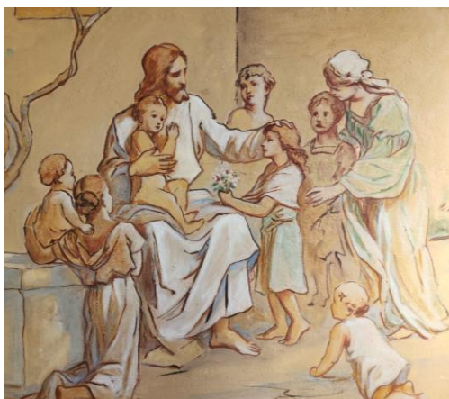
Jesus with the children, Salem Church office mural.

Salem Presbyterian Church P.O. Box 678 15240 Main Street Venedocia, Ohio 45894