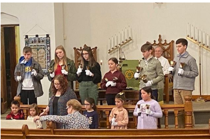
2023-01-15 Junior Bells Special Music