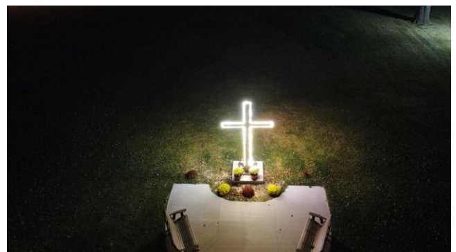
Aerial view by drone of the existing Landeck Cross and their benches as constructed by the Lions Club.

Please collect gravy packets . The goal for our church this year is 500 packages to donate to the Salvation Army by December 11th.