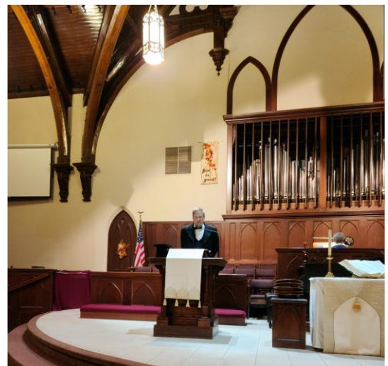
2022-11-20 The Abraham Lincoln impersonator speaks of Thanksgiving at the Van Wert County Thanksgiving Eve Service with the countywide ministers.