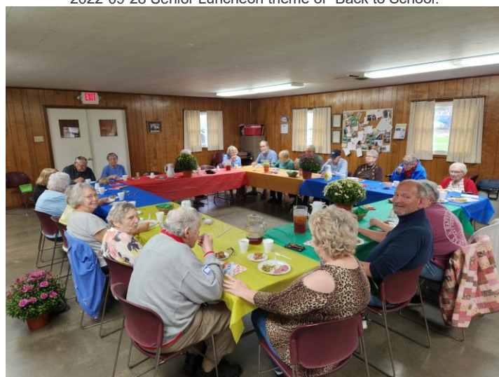
2022-09-28 Senior Luncheon at the Lion's Club building after a summer off.