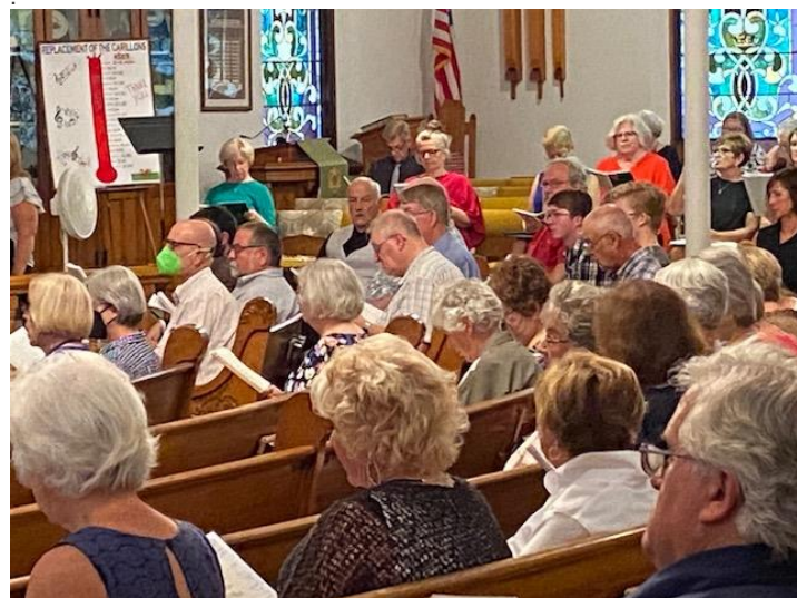
2022-09-18 Drive Your Tractor to Church Sunday / Blessing of the Harvest. Twelve tractors participated.