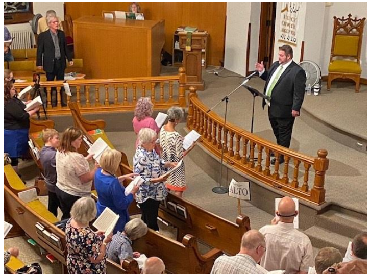
2022-09-04 Gamanfa singing by the musical group, Inspiritu.