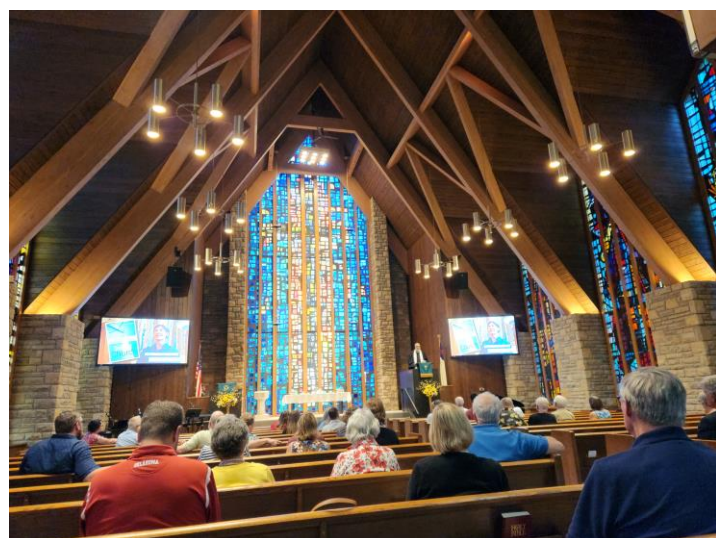
2022-09-20 Maumee Valley Presbytery meeting at the First Presbyterian Church of Norwalk, Ohio.

NOTICE The Election Day Supper, Tuesday, November 8 th . Has been cancelled.