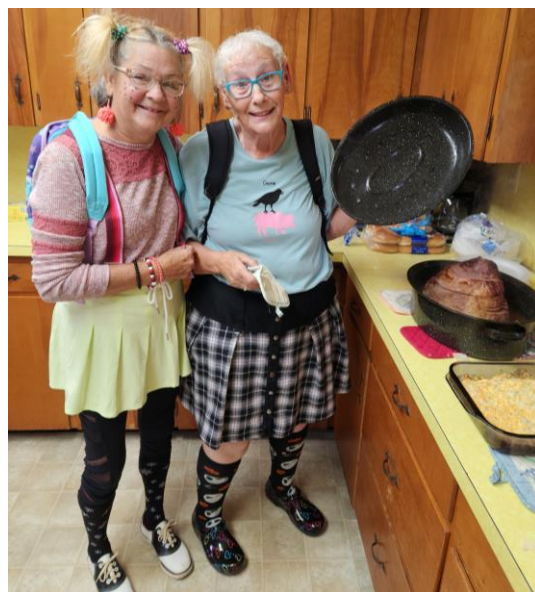
2022-09-28 Senior Luncheon theme of "Back to School."