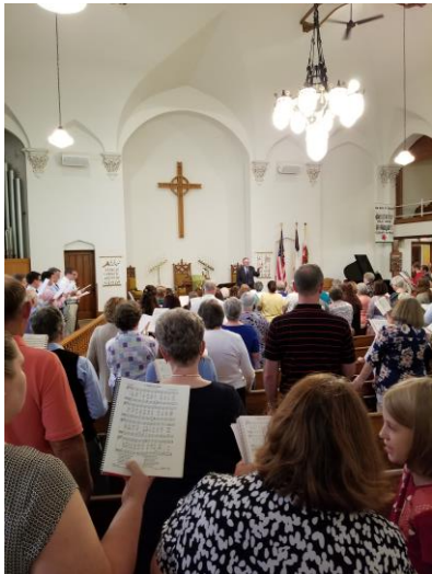
As shown is the 2020 Gymanfa.

The year 2022 advance printed program can be seen at: http://salemchurch.cc/Gymanfa%20Program%202022.pdf