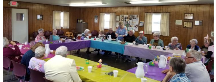
The fun-filled Senior Luncheon begins again this September 28 at noon at the Venedocia Lions Club. Shown is the Easter month gathering with Bingo.