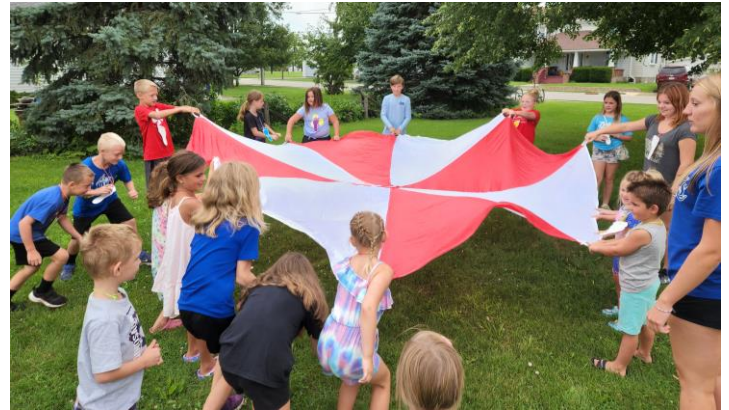
Fun outside break time