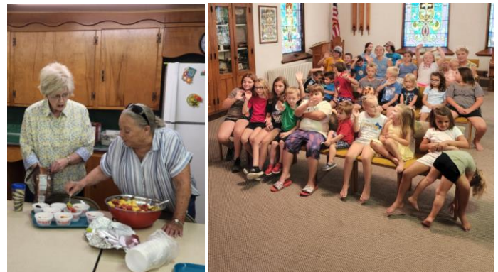
Snacks and rehearsal before heading home.