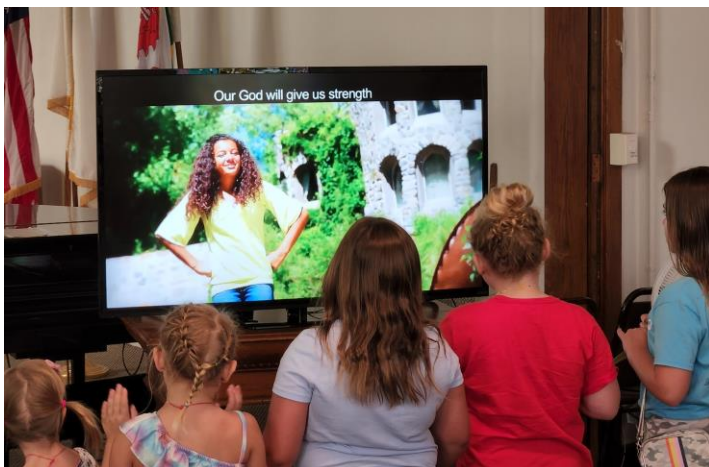
One of the Theme songs of "Stand Together" by Kid Rock VBS was used for worship time. Music Link .