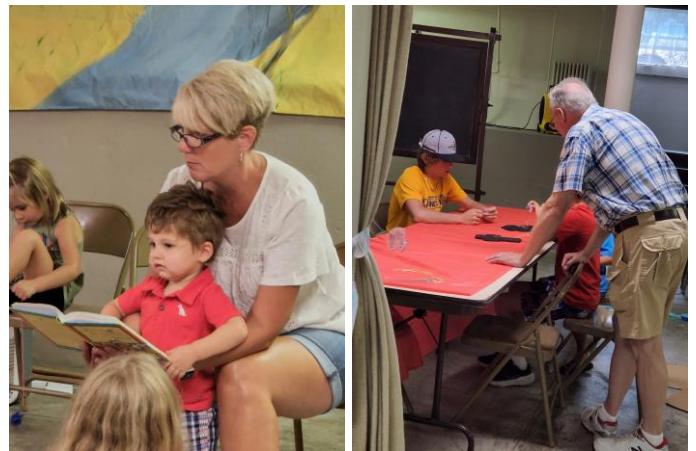
Bible Story Time and Craft Time