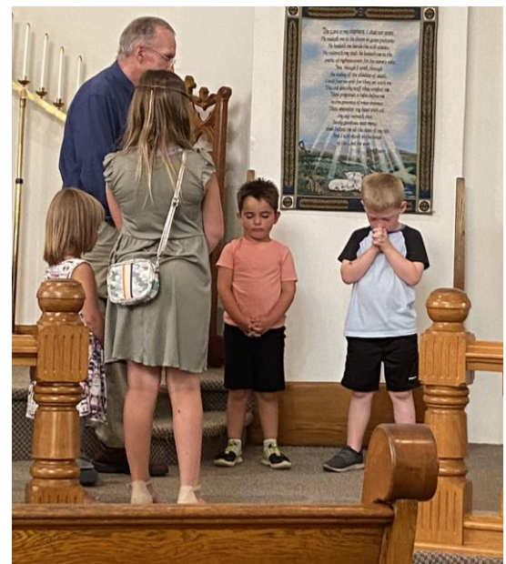
2022-06-26 "Time for Children" children praying.