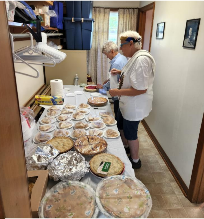
Enjoying ice cream, homemade pies, and Venedocia sausage sandwiches.