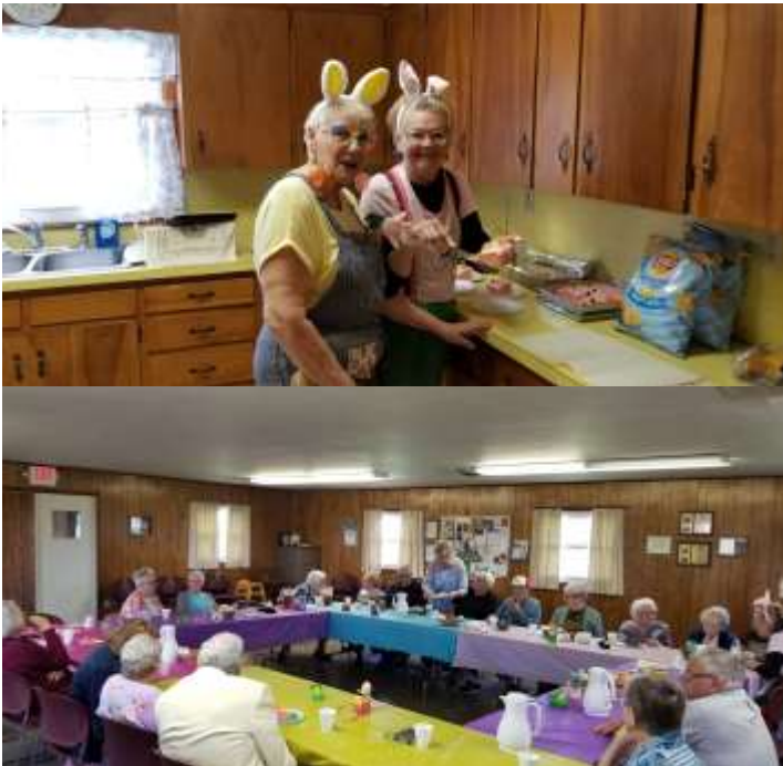
Senior Luncheon 2022-04-27 at the Lions Club.