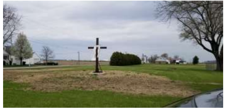
The Venedocia Lions are offering Salem a lighted cross to be installed free of cost on the eastern edge of the parking lot; the morning sun will shine behind it. Here shown is the Landeck cross being installed before landscaping across from the Landeck church.

The Salem Trustees would like to thank the congregation for their continuing financial support. We recently repaired the hot water heater at the Manse and replaced the storm door and framing on the south side office door of the Church. The north side entrance door was also repaired. Future projects are to replace south side basement door. Boiler inspection was completed for 2022. We continue to keep our church in great shape with your continued financial support. Any questions, please contact a Trustee.