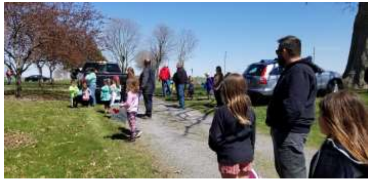
Memorial Park gathering for the Lions Club Easter Egg Hunt 2022-04-16.