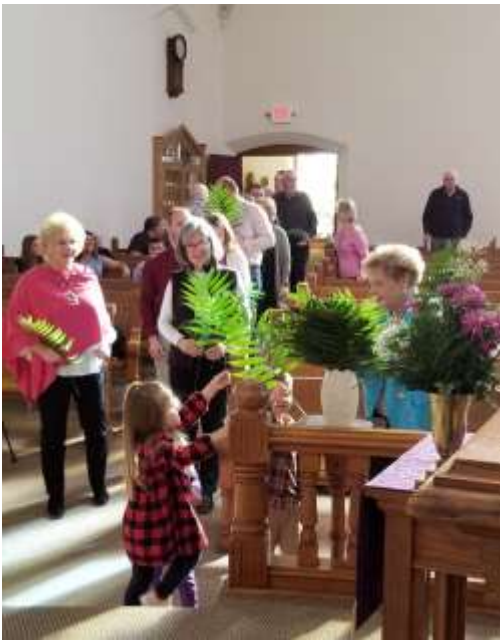
Salem Palm Sunday 2022-04-10.