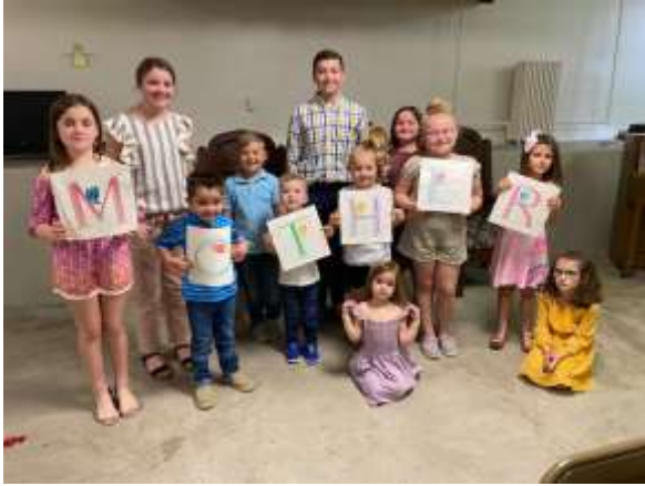
Salem Children's Sunday School Class preparing for Mother's Day

Salem Presbyterian Church P.O. Box 678 Venedocia, Ohio 45894