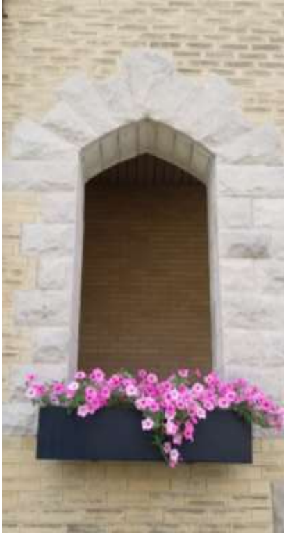
May 20, 2021 A porch window view at Salem..

Salem Presbyterian Church P.O. Box 678 Venedocia, Ohio 45894