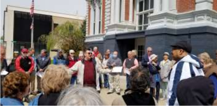
May 6, 2021 – National Day of Prayer celebrated at the Van Wert Courthouse with a peaceful crowd and public prayers for America.