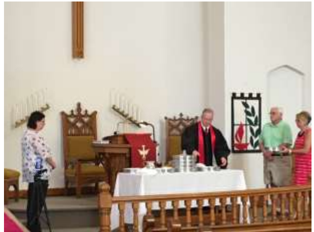
May 23, 2021 – Communion handed to the Elders to be served.