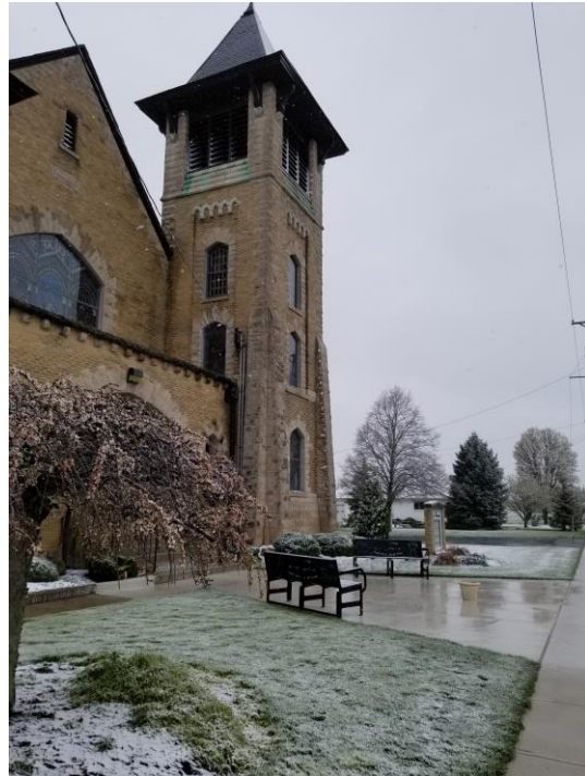
April 17 The last snowstorm falling on the spring flowers