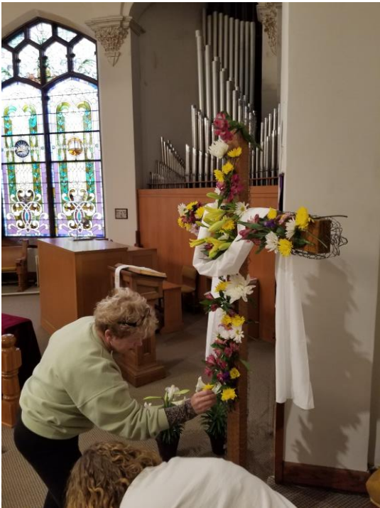
April 11 Preparing Flowering of the Cross for Easter