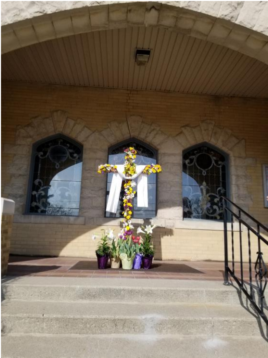
April 12 Flowered Cross for drive-by view and traditional Easter family photos