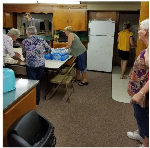
Sept 2 The many food volunteers for the Gymanfa supper.