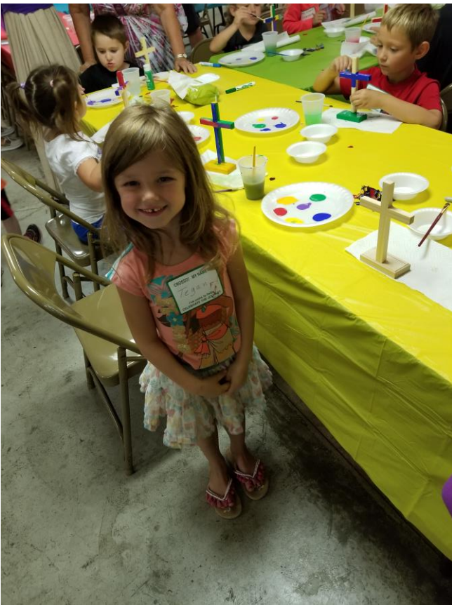
August 1 st Vacation Bible School crafts