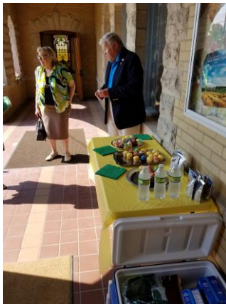
Vacation Bible School reception cupcakes