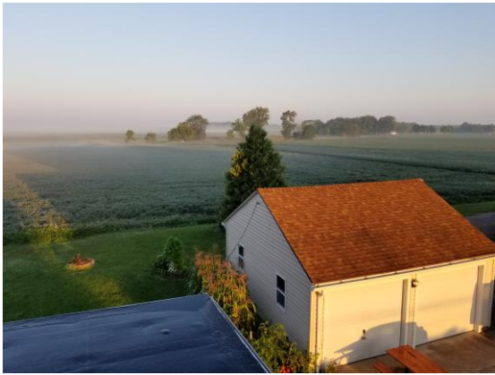
Sunrise in Venedocia

Salem Presbyterian Church P.O. Box 678 Venedocia, Ohio 45894