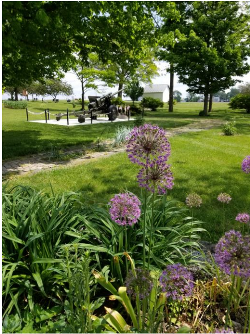
Memorial Park artillery piece

Salem Presbyterian Church P.O. Box 678 Venedocia, Ohio 45894