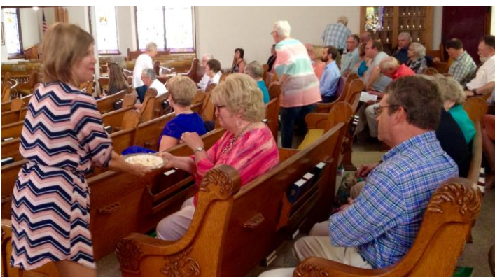
Session Members serving Communion