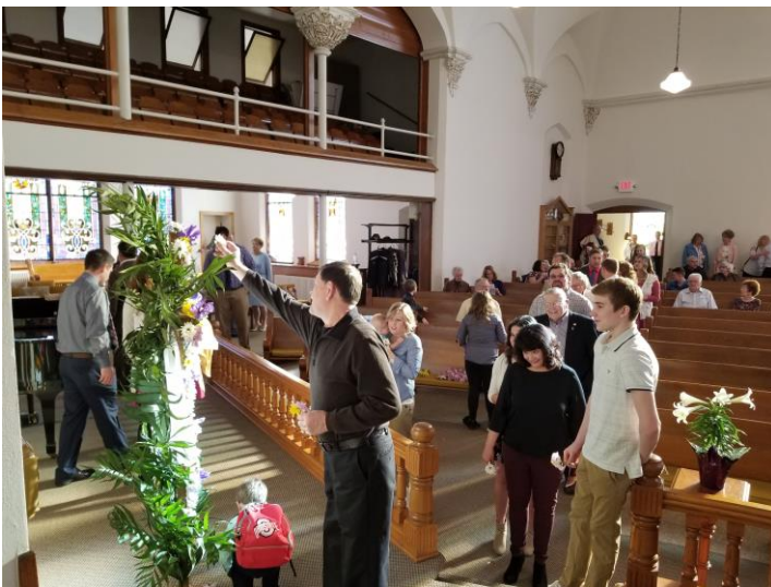
Lining-up for the Easter Flowering of the Cross