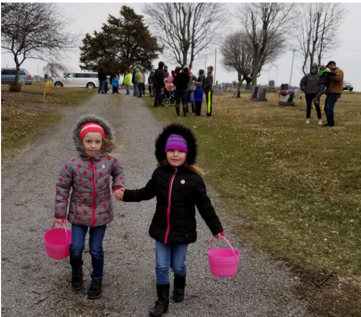
March 31 st Venedocia Egg Hunt