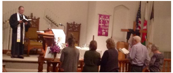
March 29 th Maundy Thursday Service and Communion