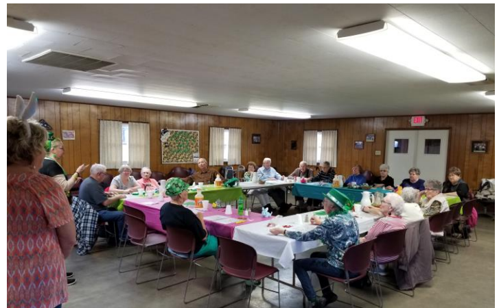
March 28 Senior Luncheon