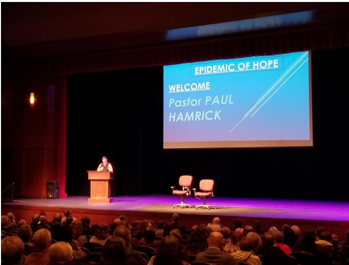
Darryl Strawberry Van Wert County April 15 church event against the epidemic of opioid addiction