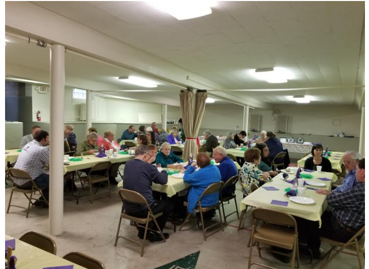
April 1 st Easter Early Meal Together