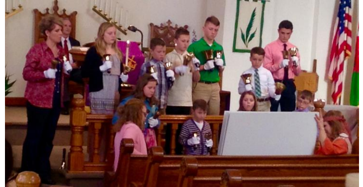
Children's Bells on Easter