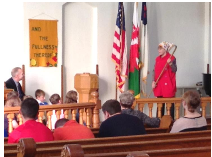
"Sandy play" talking about the Good Shepherd to the youth