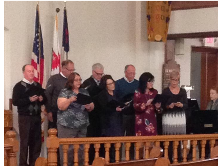
Double Quartet for Special Music