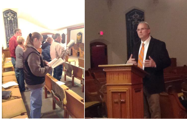
Thanksgiving Eve Service