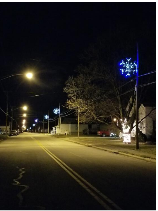
Christmas street lights in Venedocia by the Lions Club