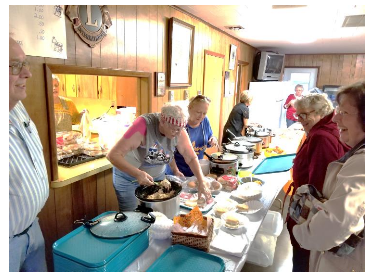
The Election Day Dinner