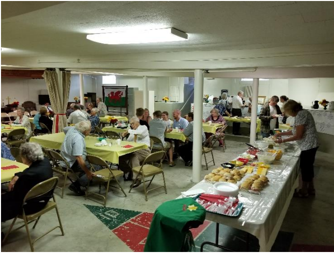
The mealtime fellowship