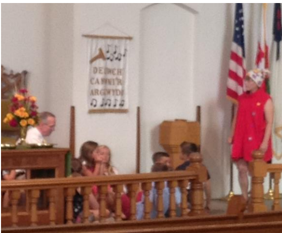
Time for Children "Sandy Skit"