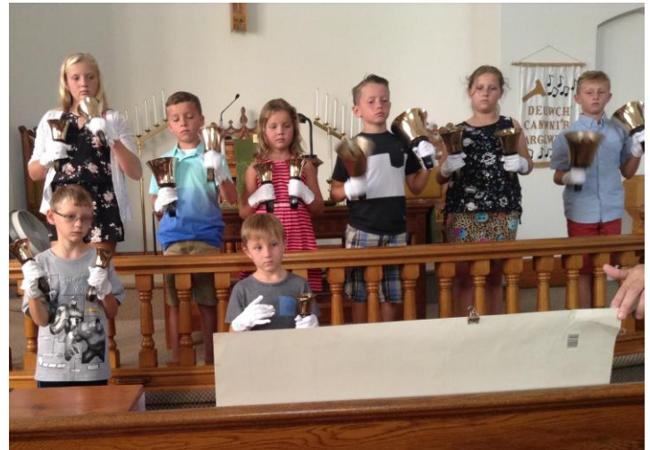
Junior Bell Practice