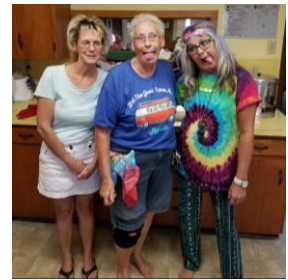
Upstart Senior Luncheon and Bingo fun and cheer