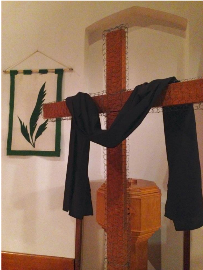
Maundy Thursday Service Cross