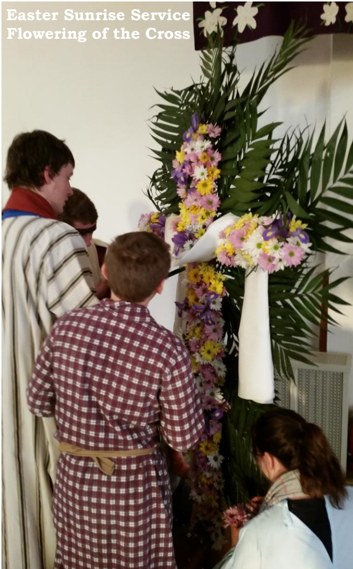
Easter Sunrise Service Flowering of the Cross