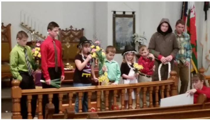
St. David's Day Celebration