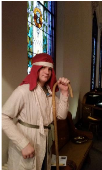
Flowering Cross & Dawson Kimmet (actor)