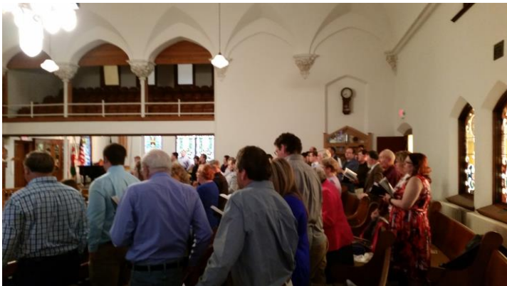
Easter Second Service Congregation