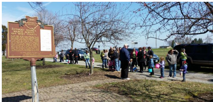
Venedocia Community Easter Egg Hunt