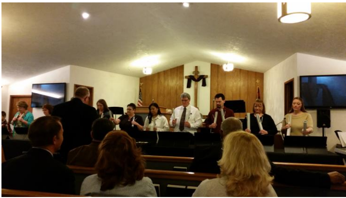
Spencerville Community Lent Service special music using chimes