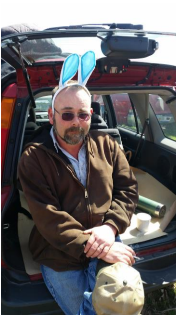
Doug Jones as the Easter Bunny