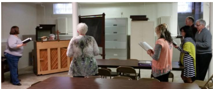
The Senior Choir practices for Easter