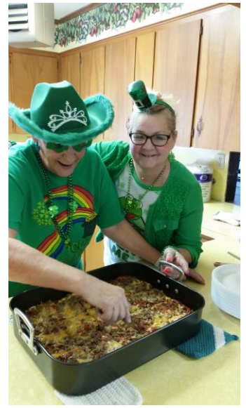
Senior Luncheon Servers