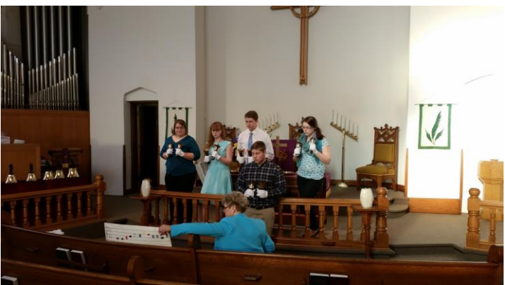
Palm Sunday Bells