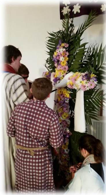
Flowering the Cross at Salem on Easter

Paul wrote to the Roman Christians to tell them about Jesus' free offer of eternal life and how to receive it. He wrote in Romans 10:9-10, "If you openly declare that Jesus is Lord and believe in your heart that God raised him from the dead, you will be saved. For it is by believing in your heart that you are made right with God, and it is by openly declaring your faith that you are saved." Make Jesus the boss of your life, tell others about your commitment, and believe that Jesus was raised from the dead.