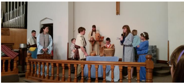
Easter Sunrise Service Youth Skit