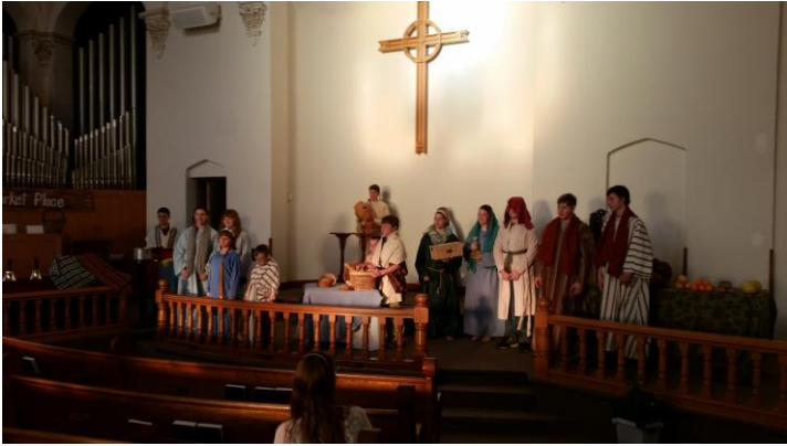
"Mystery of the Shaking Ground" Actors