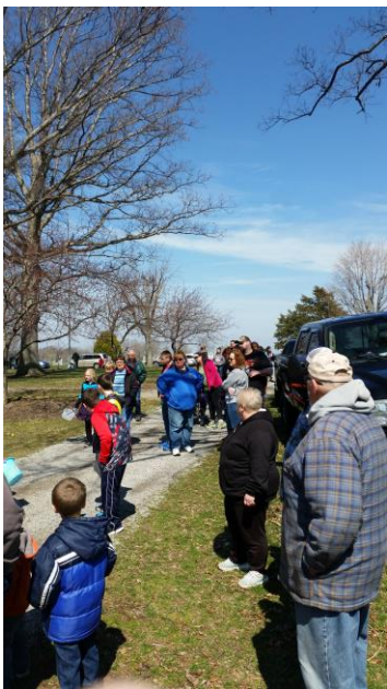
Easter Egg Hunt at Memorial Park