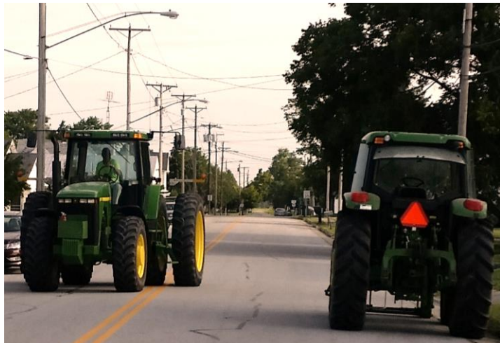
Blessing of the Tractors - August 23, 2015