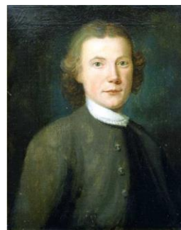
Count Nicholas Zinzendorf

When the Monrovia evangelist, Count Nicholas Zinzendorf, was a young man, he had an experience in an art gallery that changed his life forever. From a life of wealth and luxury, Zinzendorf had been reared and trained for a diplomatic career in the Court at Dresden.