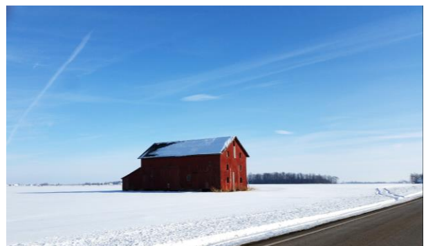
State Route 116 near Venedocia