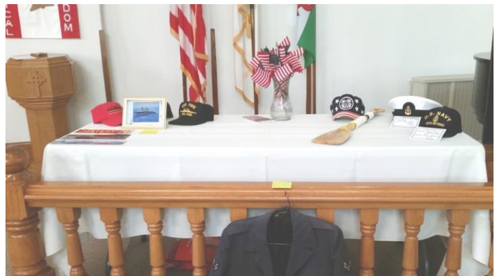
Veteran's Day exhibit table