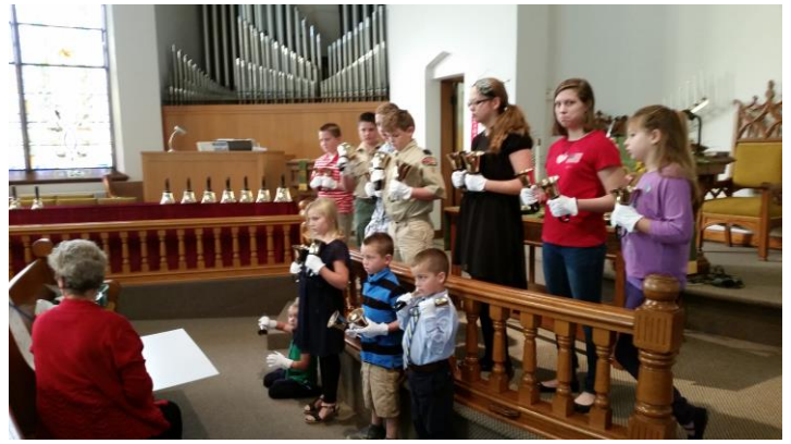
Junior Bell Choir practice