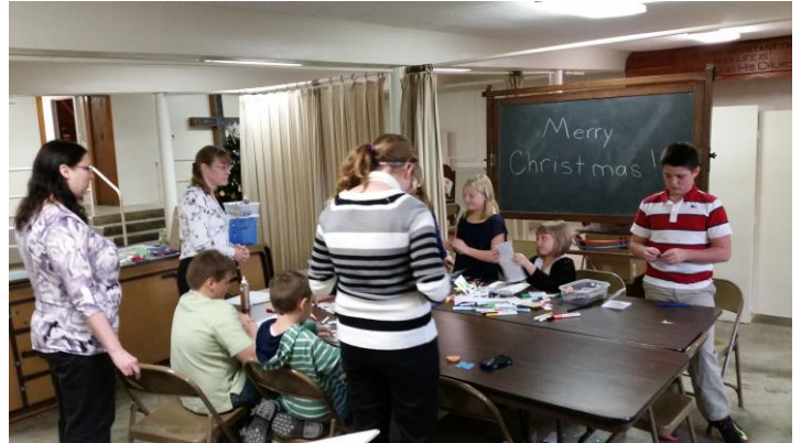
Elementary Sunday School wreath-making to give away