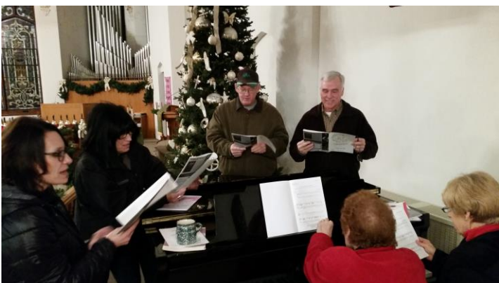
Singers preparing for the Christmas program