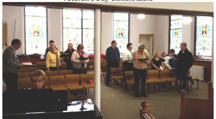
Adult Sunday School singing