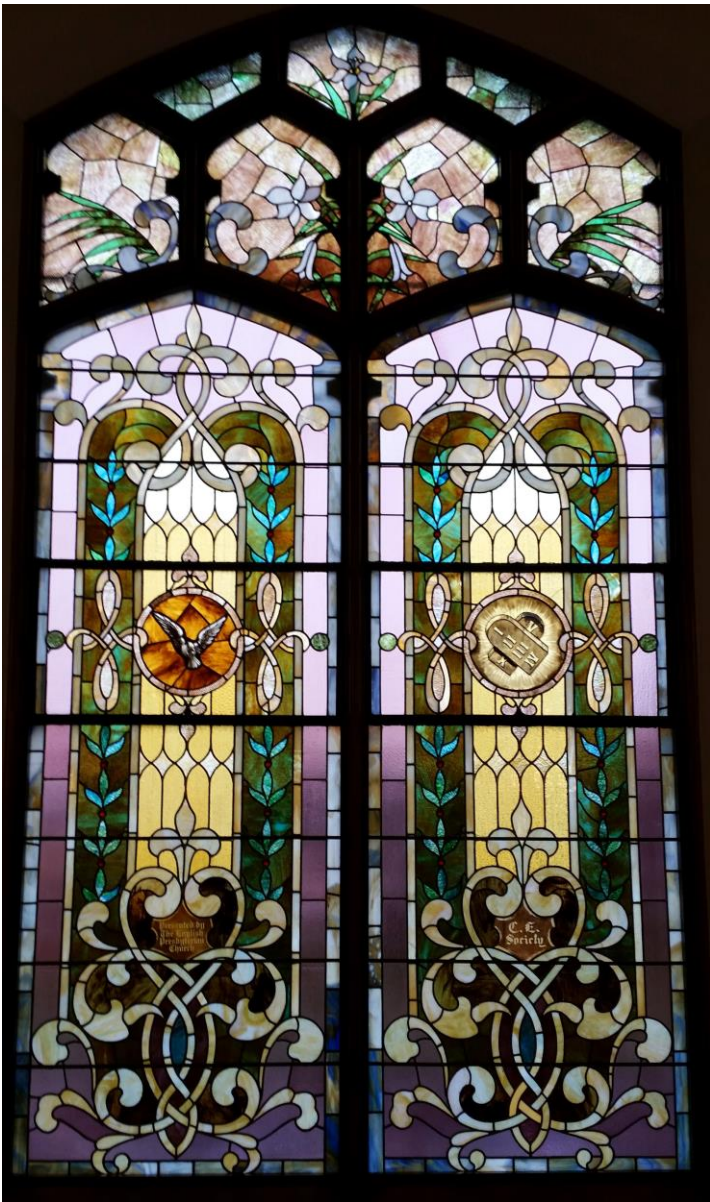
Dove and 10 Commandment Windows