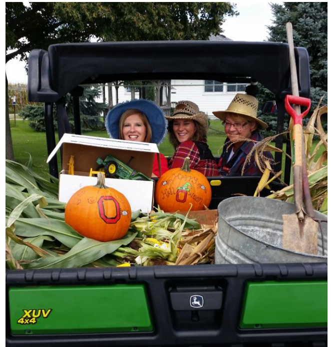
Salem Country girls