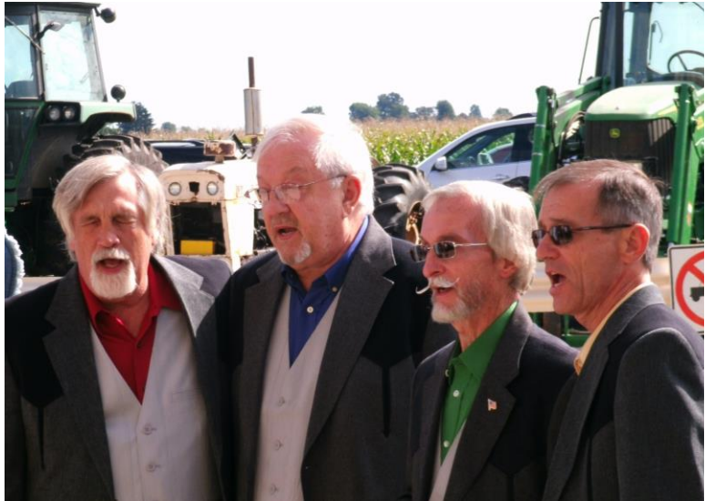
Singing Barbershop Quartet