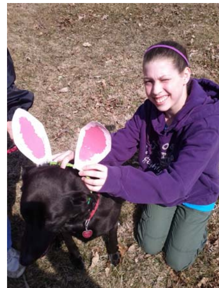
Easter Bunny Dog