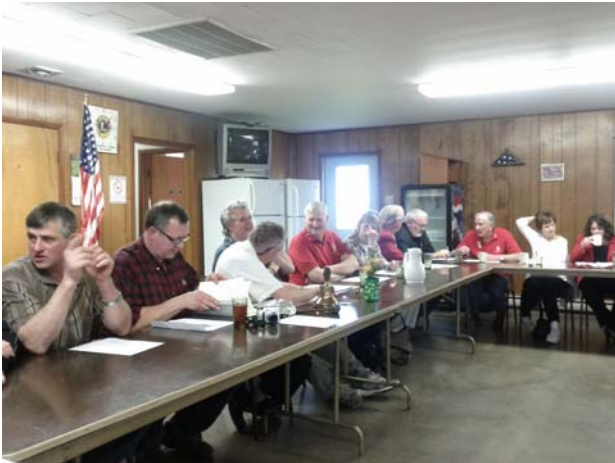
April Lions Club Meeting