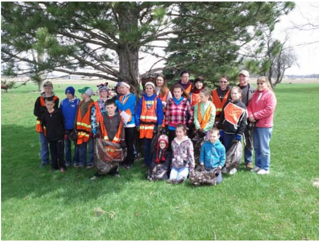
Youth Roadside Can Pickup York Township