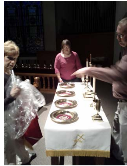
The on-going Church Setup