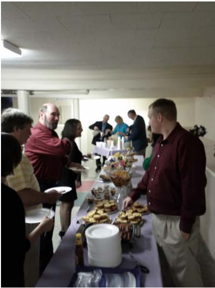
Salem Easter Meal